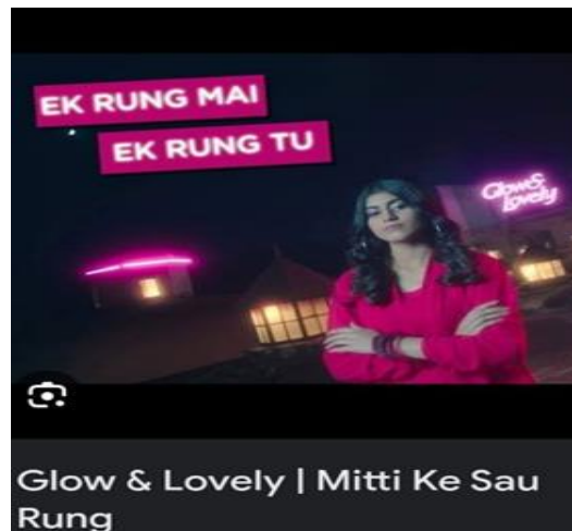
Figure 6. Celebrating Diversity