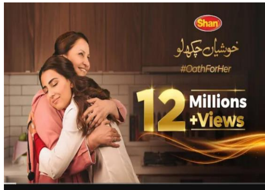
Figure 1. Female Empowerment and Dual Roles