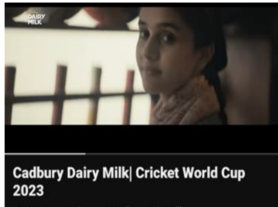
Figure 2. Breaking Gender Norms