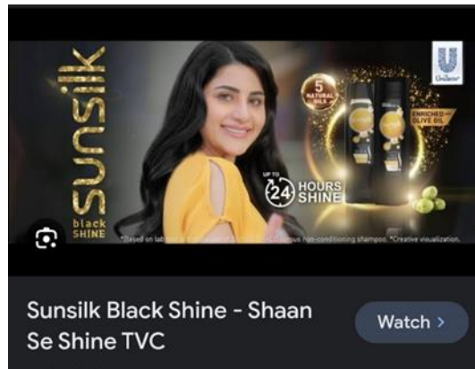
Figure 4. Political Participation