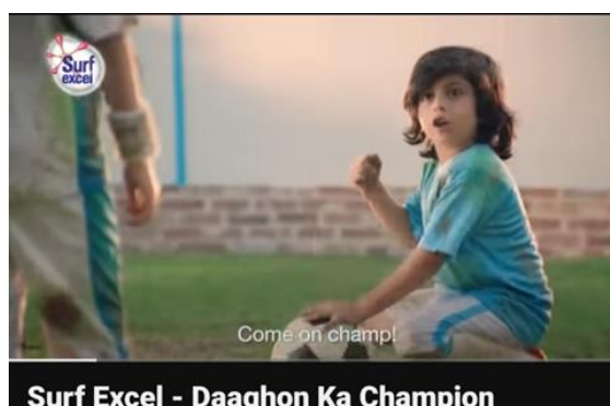
Figure 5. Champion Spirit: Advertisement